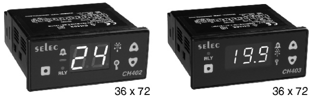
36 x 72